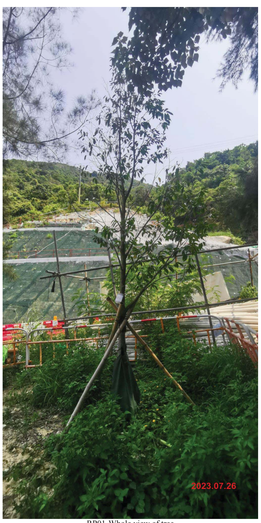
RP01-Whole view of tree