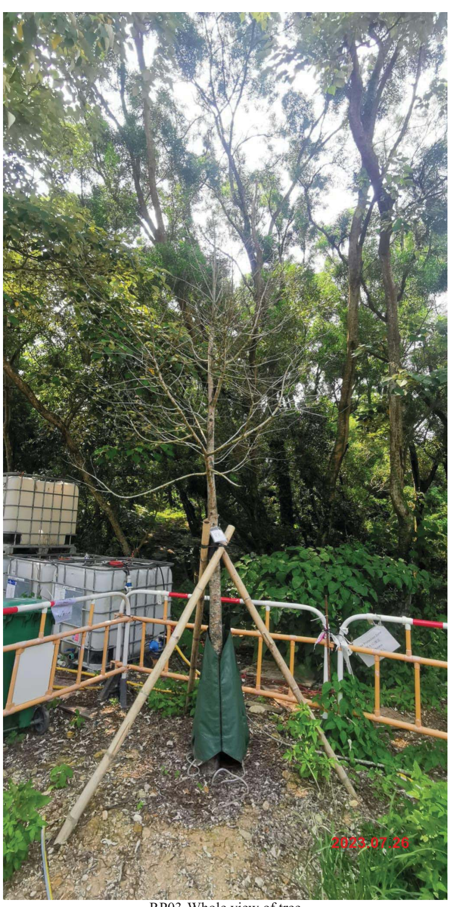
RP03-Whole view of tree