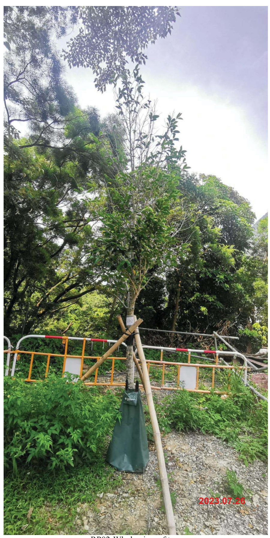
RP02-Whole view of tree