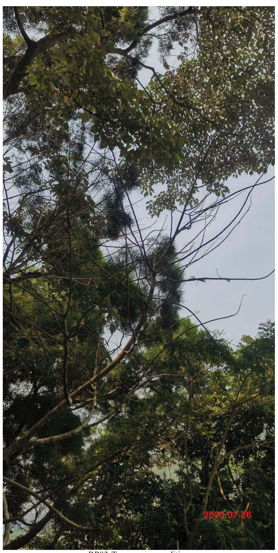
RP03-Tree crown condition